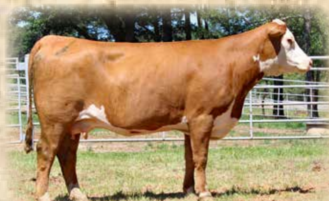
B782 A DAUGHTER