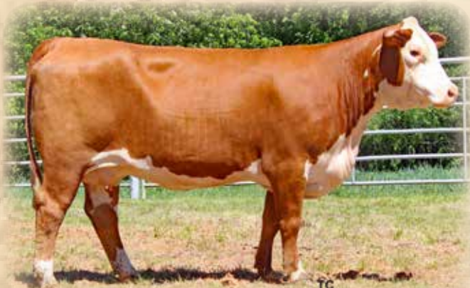
738B FULL SISTER