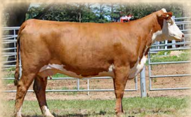
B787 A DAUGHTER