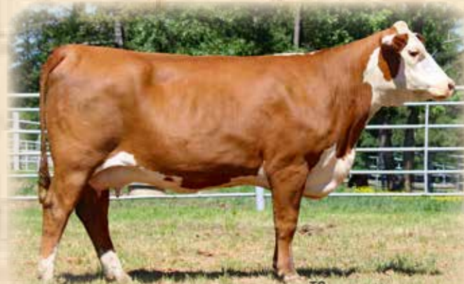
B781 A DAUGHTER